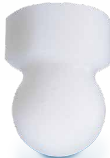
TankJet VSM tank cleaning nozzle for tanks up to 5' (1.5 m) in dia.