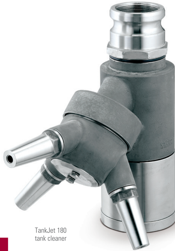
TankJet 180 tank cleaner